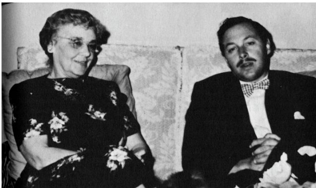
Edwina & Tennessee Williams

This section shows the impact this production had not only in the world of theater, but also to other forms in the performing arts. It also discusses the impact on our relationships with our family. We can relate the experiences of the characters to our own, people sharing the same world, facing economic and social challenges and finding our own way in the world.