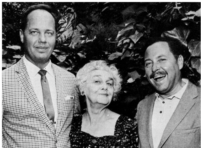
Dakin, Edwina and Tennessee Williams

In our materials, students meet professionals who discuss the concepts addressed in Tennessee Williams’ “The Glass Menagerie.” They cite their personal experiences bringing this play to life. We point students toward the greater cultural, social and economic forces at work that shaped the play, playwright and various productions of “The Glass Menagerie.” Using this guide, you can address topics including language arts, social studies, women’s studies, science and technology, politics and media.